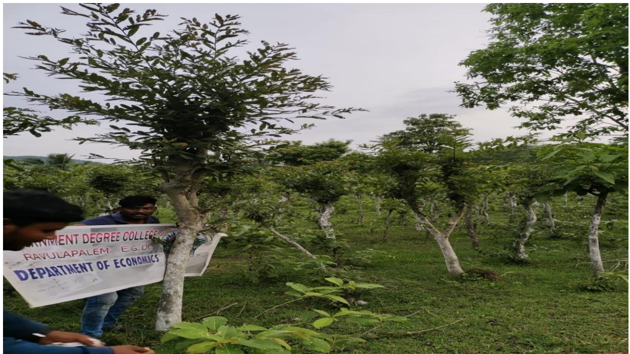
Sericulture Plants at maredumilli