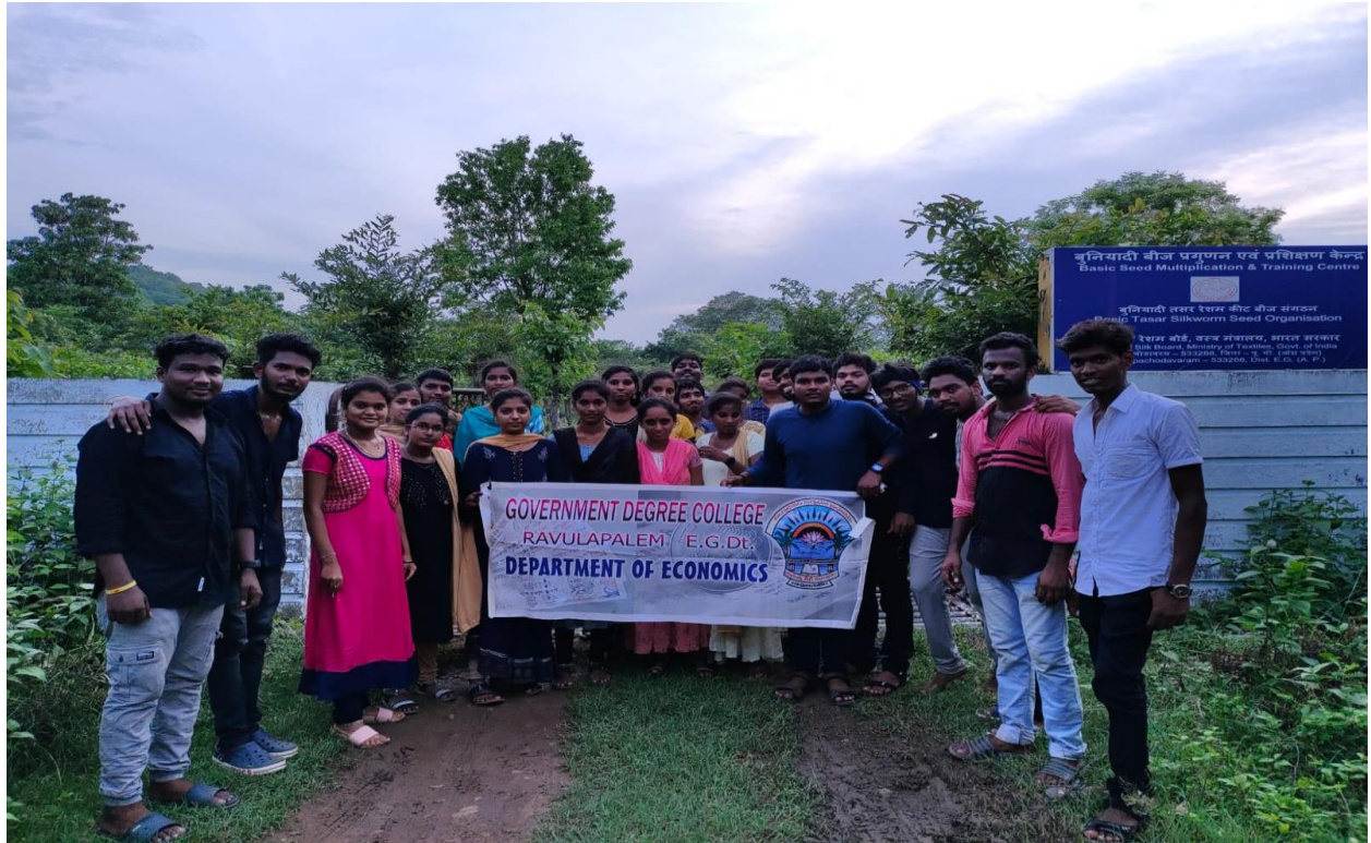
Sericulture Plant at Maredumilli