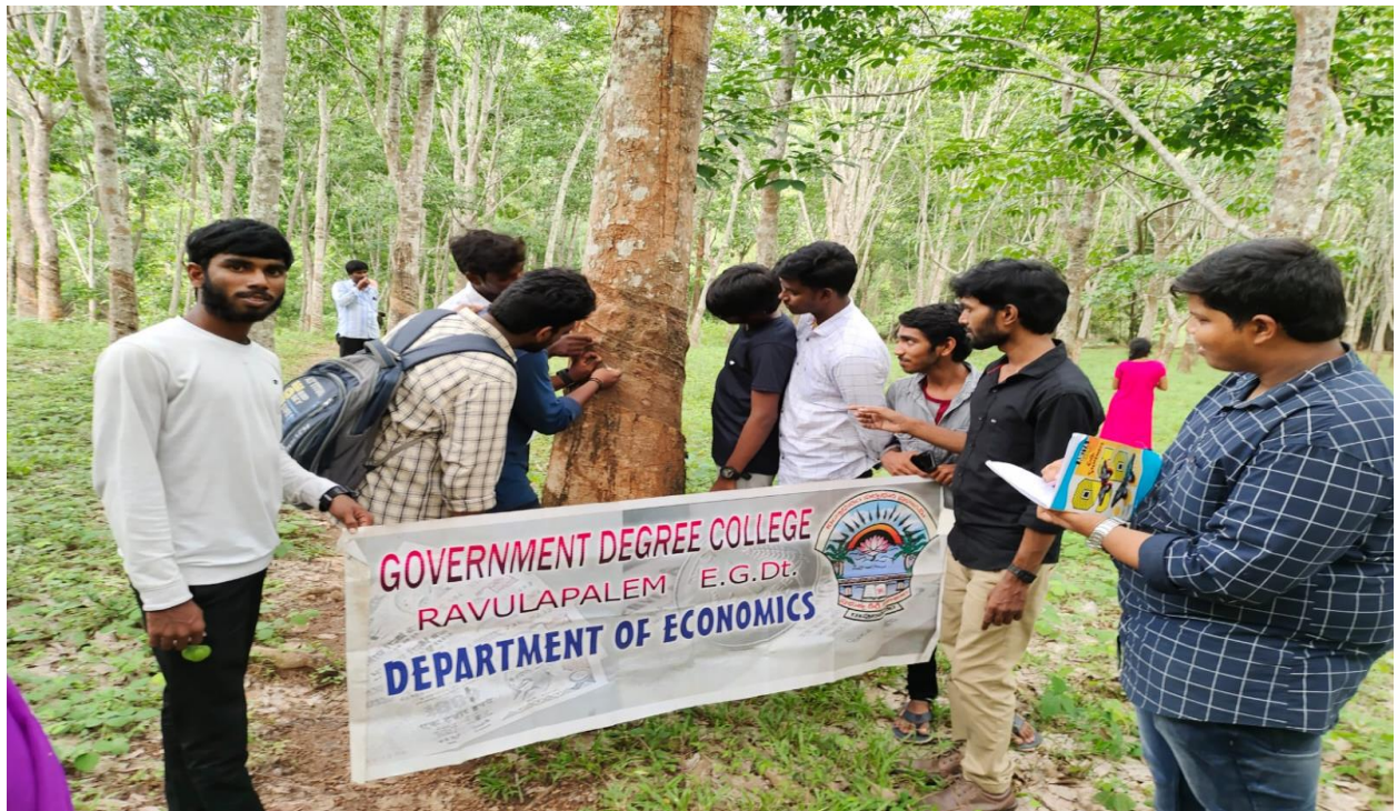
Rubber Plantation at Rampachodavaram